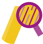
FINISHED FEED ANALYSIS