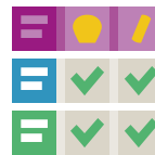
BEST NUTRITIONAL MATRIX